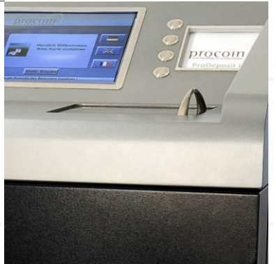
➔ money changers