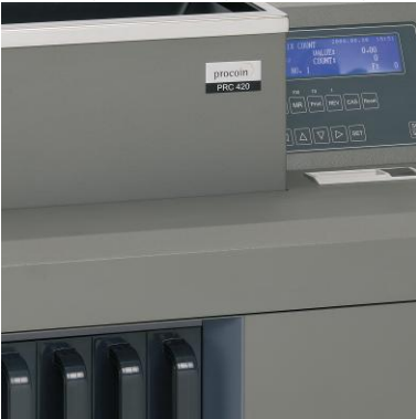
➔ coin sorters