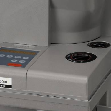
➔ coin counters