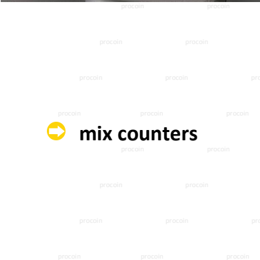
➔ mix counters