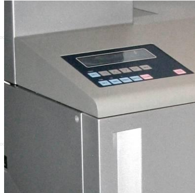
➔ coin packaging