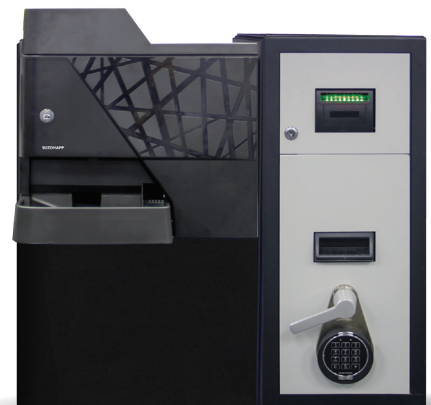
SPS-300 Paired with the CRS-600