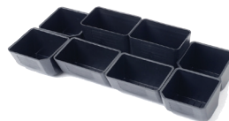
TellerCup Coin Cups