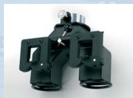
Double outlet with bag holder