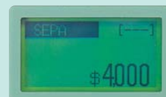
total value (7 digit)

Counts a specific denomination. When a bill of a different denomination is detected, the machine temporarily stops. When bills are removed from the stacker, counting resumes.