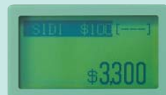
total value (7 digit)

Detects the denomination and orientation of the first bill, and counts only bills of the same denomination and orientation. Other bills are fed to the pocket.