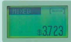
total value (7 digit)

Identifies and counts mixed denomination bills, providing an error-free summary of each denomination and/or the total count.