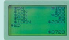
value by denominations newly issued (6 digit)

*Display shows bill count and amount by denomination.