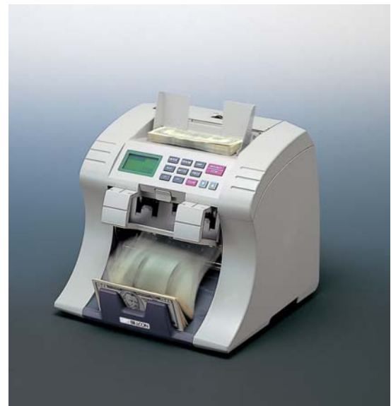
1,200 notes-per-minute speed counting.

Two communication ports for RS-232C can be installed for connection to devices such as personal computer, serial printer and cash settlement system.