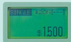
total value (7 digit)

Counts a specific denomination. Bills of a different denomination are fed to the pocket.