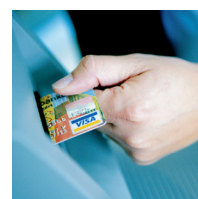
Choose between different card readers (option).