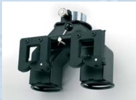
Double outlet with bag holder