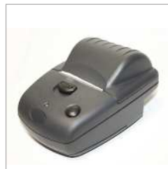
Mini thermal printer