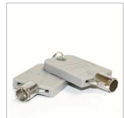
Secure cam locks