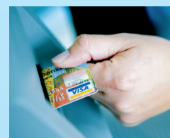
Different card readers (option)