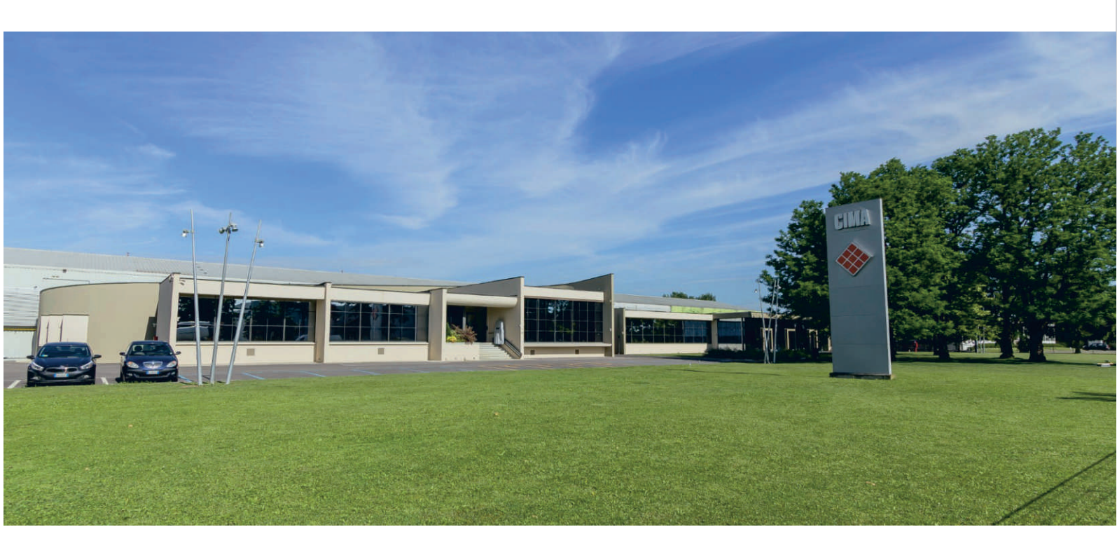
HQ: CIMA S.p.A. Via di Mezzo 2-4 – 41037 Mirandola MODENA – Italy

CIMA Cash Handling, America Inc. 1300 W. Sam Houston Pkwy. South, Suite 100 Houston TX 77042 info@cima-america.com www.cima-america.com