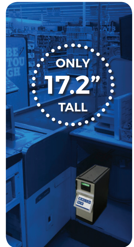
Installed directly at the point of sale