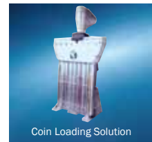
Coin Loading Solution